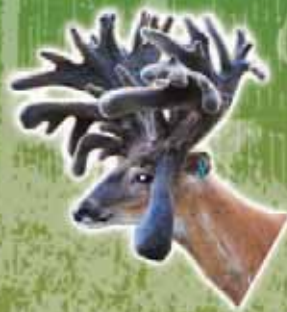
Double Down 382"

Two of our long-time satisfied customers