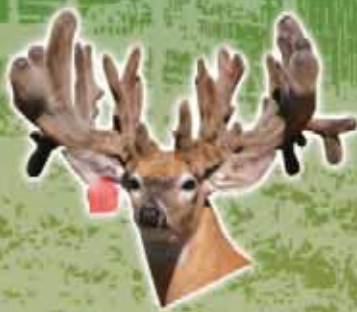
PWF Tonto 310"

▶ STRESS TABS Helps relieve handling stress