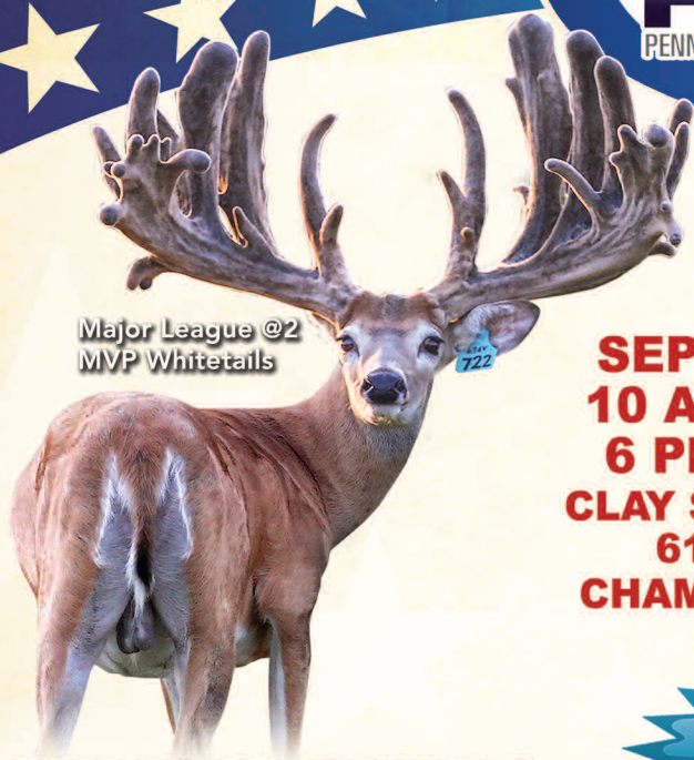
Major League @2 MVP Whitetails