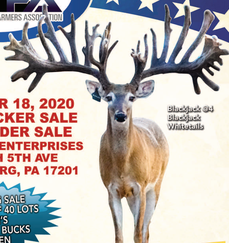
Blackjack @4 Blackjack Whitetails

SEPTEMBER 18, 2020 10 AM STOCKER SALE 6 PM BREEDER SALE CLAY STRONG ENTERPRISES 610 NORTH 5TH AVE CHAMBERSBURG, PA 17201