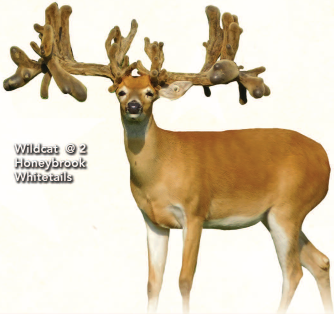
Wildcat @2 Honeybrook Whitetails