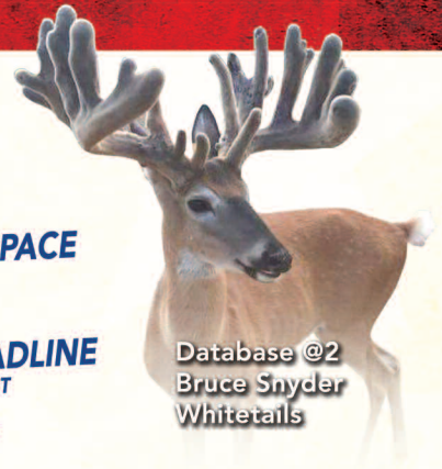
Database @2 Bruce Snyder Whitetails

STOCKER-BUCK DEADLINE SEPTEMBER 1 ST LIMITED ENTRIES