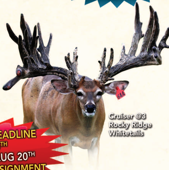
Cruiser @3 Rocky Ridge Whitetails

EVENING SALE CONSIST OF 40 LOTS DOE'S BREEDER BUCKS SEMEN